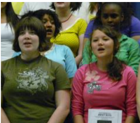
Chorus sings in May Celebration of the Arts