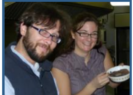
Colombian teacher and Red Leaf Coordinator

Twenty four students from Colombia joined our Great Lakes community for 4 weeks this past spring through the "Red Leaf Mini Stay Program". They lived with local families and participated in our GL classes. With the help of their two accompanying teachers, we hosted a truly Colombian meal on their final day of classes. They and several of our GL students enjoyed a 4 day trip to Quebec City on Easter weekend. Many good friendships were made over the 4 weeks.